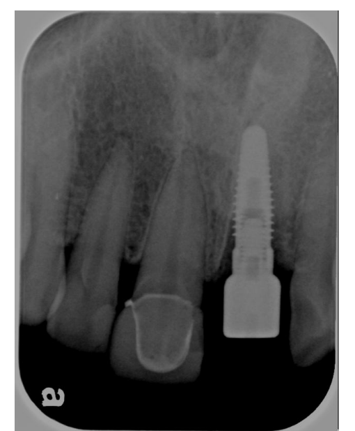
Camlog implant 4.3mm, 11mm diameter placement