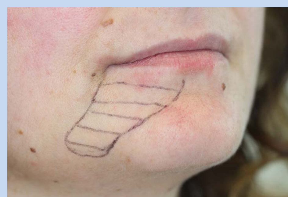
Figure 3: Mapping of the affected area.

The radiological examination showed protrusion of the implant in the alveolar nerve canal in one case treated alio loco. In the other cases proximity to the inferior alveolar canal was evident and x-rays measured using ImageJ®.