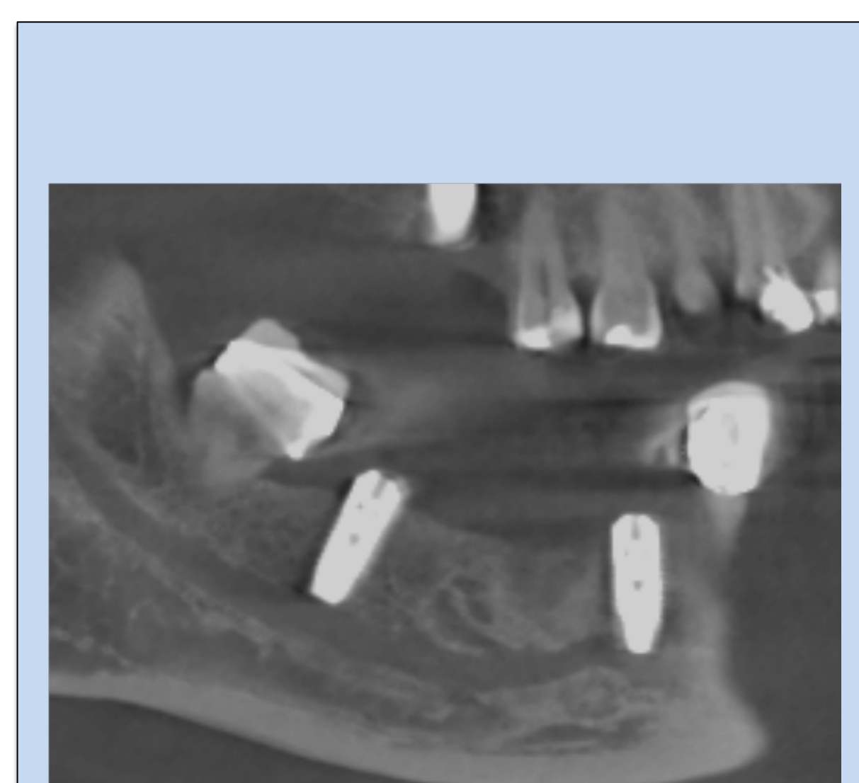
Figure 4: Cone beam CT indicating placement of the mesial implant in the inferior alveolar nerve and the distal one at the roof of the canal.

Using a prospective human study design, data are presented as mean and statistical comparisons were performed using the Mann-Whitney Test or Spearman Correlation. The analysis was done with JMP® 10.0 statistical software (SAS Institute, Cary, NC, USA)