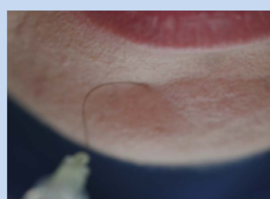
Figure 1: Mechanical Detection Threshold (MDT) was measured with a standardized set of modified von Frey filaments (Optihair2-Set®).

QST is a non-invasive, psychophysiological approach to evaluate thermal and mechanical somatosensation. The present study applied the protocol implemented by the German Research Network on Neuropathic Pain (DFNS) 1,2 in the orofacial region. Patients who had obtained an implantation in the lower jaw combined with augmentation procedures were examined by implementing a comprehensive QST protocol for intraoral use. Patients were tested bilaterally in the innervation areas of the mental nerve (chin and lip/extraoral and intraoral) and results compared to healthy controls as well as patients being implanted several years ago and patients with a neurological deficit. Thermal and mechanical tests were performed in patients with a radiographically and clinically injured nerve as well as in patients after implantation with no clinical symptoms.